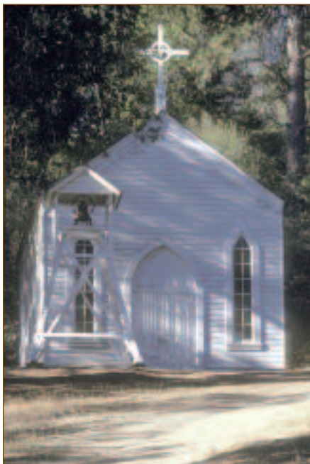
St. John's Church

The Catholic congregation of Coloma worshipped on the grounds of St. John's Church since the early years of the Gold Rush. In 1858 they dedicated the existing structure, which replaced a log church. Soon this little church fell into disrepair as the fortunes of Coloma declined and the congregation dwindled. In 1890