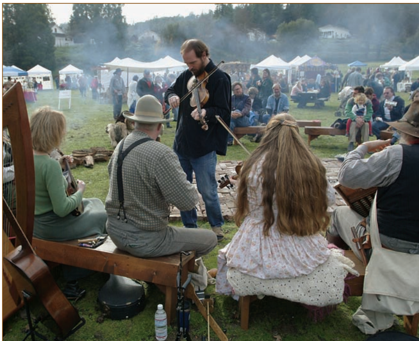
Celebrating the season at Christmas in Coloma includes music around a warming fire.

The winter holidays are not complete without the joys of an old-fashioned Christmas! Holiday shopping begins with over 60 crafts vendors selling their wares at Christmas in Coloma . Visitors can enjoy chestnuts roasting over an open fire, carriage rides, wreath making, traditional children's games, 19th-century trade demonstrations, rope making for kids, a real snow mountain, good food, and more. Docents in period dress will lead visitors on guided tour of the historic town, while strolling musicians entertain park visitors. ❁