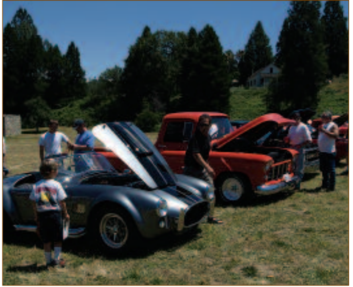
Visitors of all ages admire vehicles on display.

In between bites of great hot sandwiches and sips of cold drinks, Park visitors swayed to the swinging sounds of “Cow Bop.” Their infectious rhythms