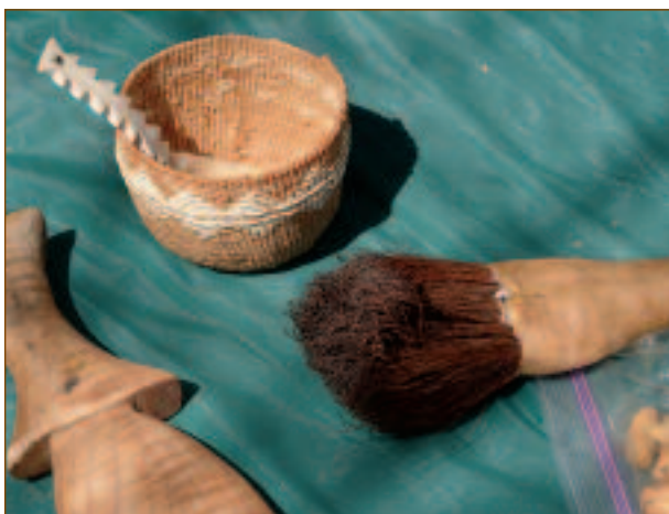
Implements on display included hand-made soaproot brush, basket, and spoon.