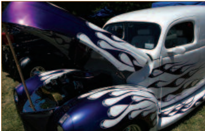
Cars of many colors catch the attention of ColomaFest car fans.