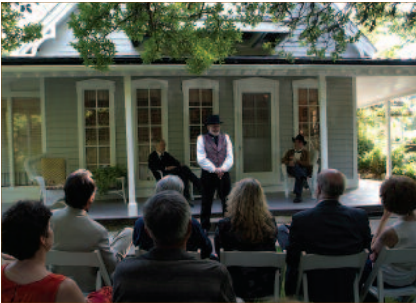
Coloma residents from the past take to the stage.