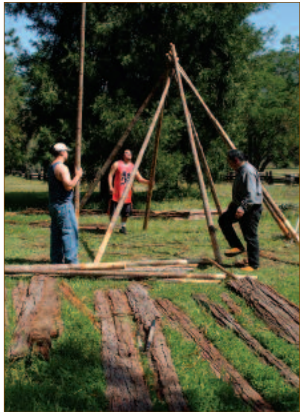
Construction of the bark house begins with a frame made of pine wood poles.

The event was presented by Traditional Cultural Protection & Advancement, Inc. , who may be contacted at honor_traditions@hotmail.com .