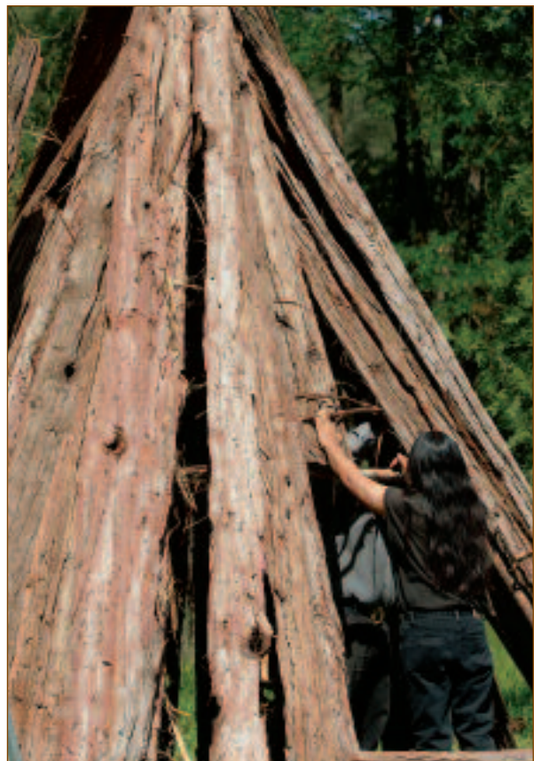
Finishing touches are added to the bark house.