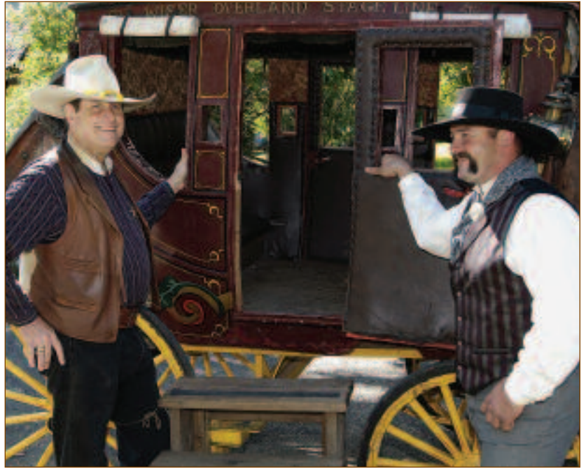
Stage coach hands welcome guests to come aboard.