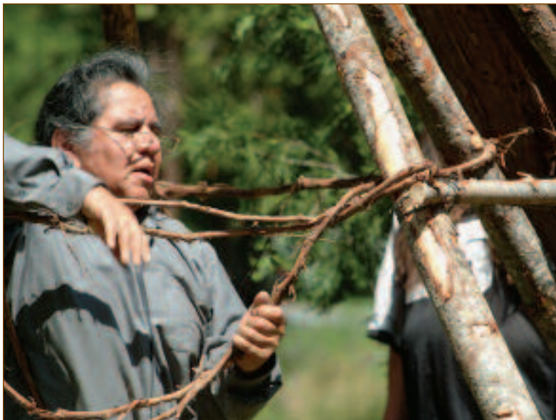
Grape vines are used to secure the bark house frame.